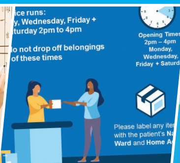
RESPONSE TO IMPACT OF COVID 19