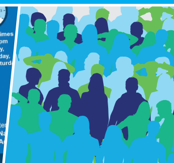
OUR MEMBERS AND SUPPORTERS